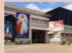
Karuna Animation Centre