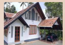
Monte Maria Santuario