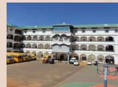
St. Mary’s Central School