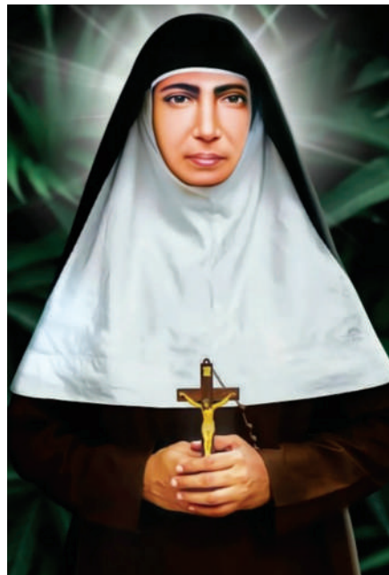
Foundress: St. Mariam Theresia