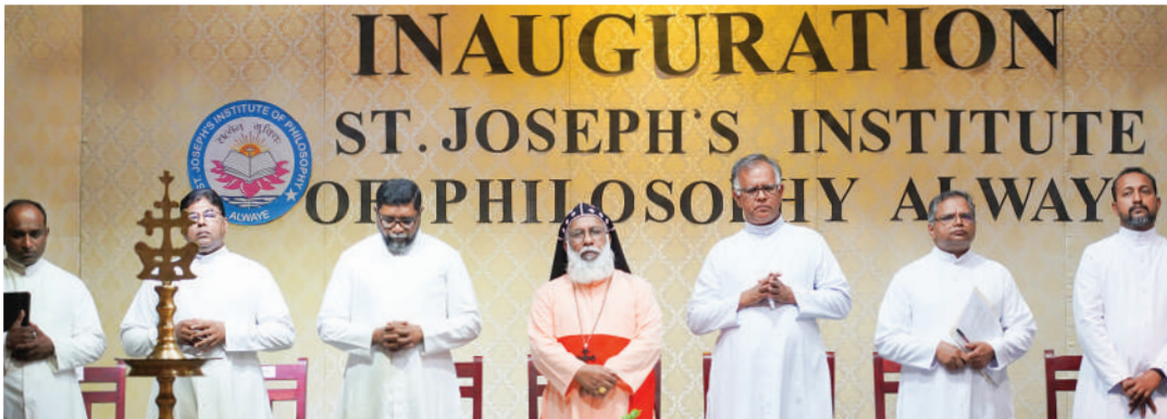
Aluva: The inauguration of St. Joseph's Institute of Philosophy, the only institution in Kerala authorized to confer an Ecclesiastical Licentiate in Philosophy, was conducted by Cardinal