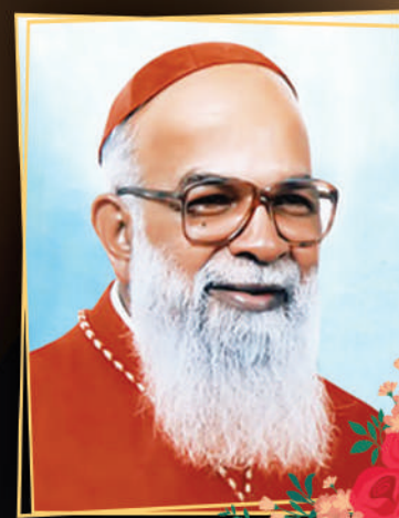
Major archbishop Cardinal Mar Antony Padiyara (23 March, 2000)