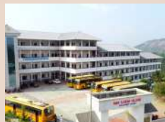
Mar Sleeva College