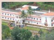
Mar Ephrem Minor Seminary