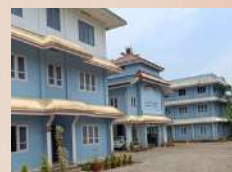
Atmajyothi Pastoral Centre